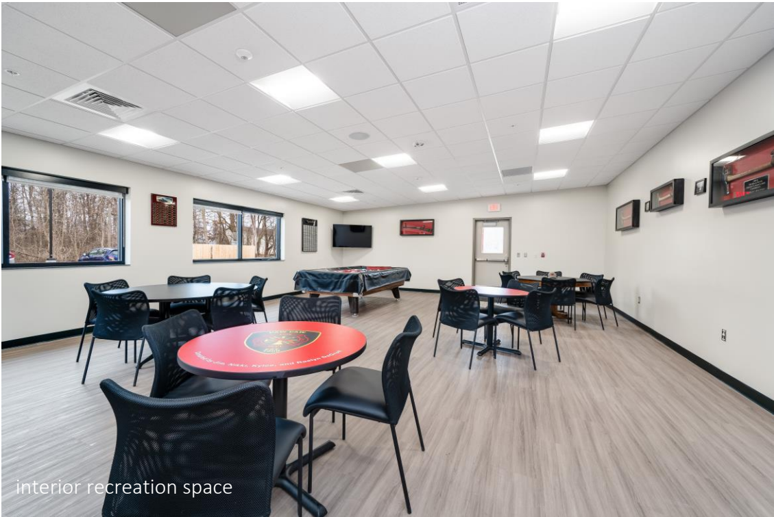
interior recreation space